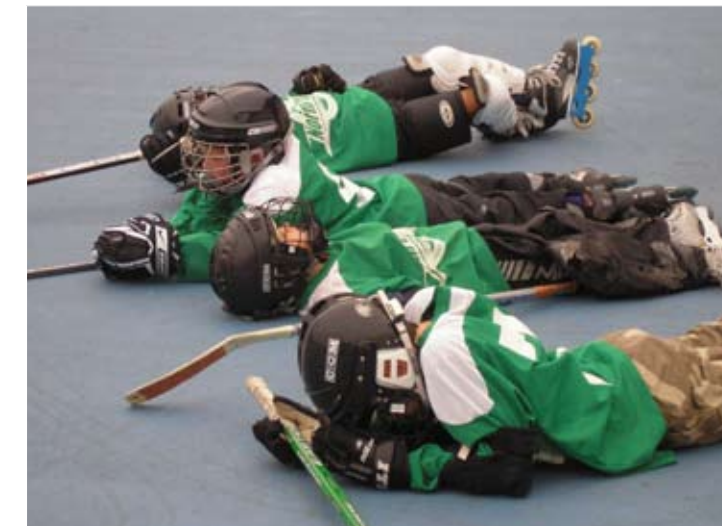
The exhausted Pastorino Hay team gave it their all in a late rally against Palladino Painting, but couldn't manage to pull out a victory in the tight Squirt battle.

W=Wins; L=Losses; OTL=Overtime Losses; Pt=Points; GF=Goals For; GA=Goals Against as of 7/7/08